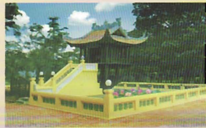
One-Pillar Pagoda model

One-Pillar Pagoda has connected closely with history of Hanoi Capital and for a long time, it has been a symbol of Thang Long in civilized lifetime. One-Pillar Pagoda has been listed as historical monument, architecture, art by Ministry of Culture dated April 18 th 1962. Miniature One-Pillar Pagoda model in the tunnels of Cu Chi-historical monument is only equal to 0,9 against with real One-Pillar Pagoda in Hanoi, it's started work on dated May 24 th 2008 and finished on dated December 19 th 2009.