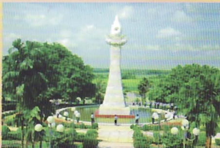
National spirit symbol