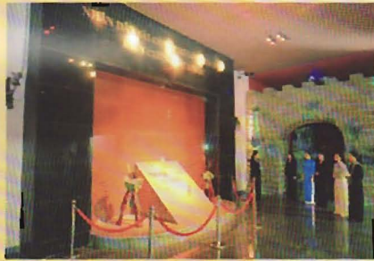
Visitors see Basement of Ben Duoc Temple

Basement is the place to exhibit the rough sand models, pictures, sculptures, which illustrate the typical revolution campaigns, exampled characters in the resilient undaunted fight of Saigon, Cho Lon, Gia Dinh people. The basement has 9 spaces, each illustrates a specific period of the over-100 year history against French, American invaders.