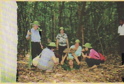
Sight-see the secret basement cover

Situated within Cu Chi Battlefield underground tunnel system, Ben Duoc underground tunnel complex was Saigon – Gia Dinh Regional Party headquarters and Military Command, has been classified as national – level Relic under Decision No. 54/VHQĐ on 29/04/1979. This is an unique project of architecture, as an underground system of tunnel deeply located in the ground bed with