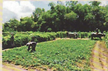
Productive views in liberated area