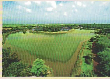
Three-region-forest and imitation pool of East Sea

Valuable wooden forest in three regions North – Middle – South is planted as S letter with area of about 4,6 ha that it's enclosed by a lake at two sides for imitating East Sea and West Sea with area of 6,8 ha. On the area planting valuable wooden as its region are built miniature three specific models: One-Pillar Pagoda (Hanoi), Ngọ Môn Gate (Hue), and Nhà Rộng Harbor (HCMC). This work shall help educating love of country and nature, learning value of Vietnamese culture-history to tourists, especially for the younger generation. It's a place to learn useful lessons on nature, sightseeing famous historical-cultural monument models of Vietnam.