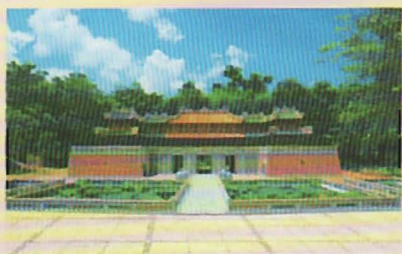
Ngọ Môn gate Hue model

Formerly, Ngọ Môn Gate was a place usually to take place important ceremonies under the Nguyễn Dynasty as Ban Sóc ceremony (grant a new calendar), Truyền Lô (pronounce name of new graduate doctors)...Miniature Ngọ Môn Gate model in the tunnels of Cu Chi has scale equal to 1/4 of real one, it's started work on dated May 24 th 2008 and finished on dated December 19 th 2009.