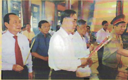
The Leaders visit the Temple

composite material in stone and copper such as designs on the column-bases, dragons, calligraphic, cranes...in aiming to bear the permanence, as well as to add more lists of the martyr's names carved on the stone epitaph. The Temple's basement, invested for building to exhibit the represented events with a topic "Saigon-Gia Dinh people staunch and dauntless" in anti-French and anti-American resistances with statues, images, sand-modules, prototypes combined with sound and light effects, will be inaugurated and opened for visiting by late 2008. The exhibited items in the Tower and the walkway connecting the basement over the Tower being invested for construction and will be early commissioned for serviced of tourists' visiting.