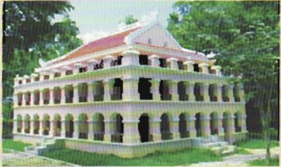
Nhà Rộng harbour model

This is a house with two dragons on the roof in style of "two dragon flanking a moon", so it called Nhà Rộng. Nhà Rộng Harbor has still kept a spiritual memory of President Ho Chi Minh to Vietnamese People. Miniature Nhà Rộng Harbor model in the tunnels of Cu Chi has scale equal to 1/4 of real one, it's started work on dated May 24 th 2008 and finished on dated December 19 th 2009.